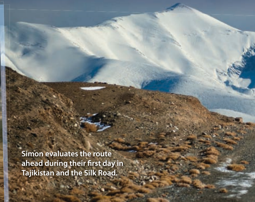
Simon evaluates the route ahead during their first day in Tajikistan and the Silk Road.

At one point, we camped with a group of Tuareg nomads and befriended Amar, the son of their chief. The eve before we were due to leave we were invited for a meal in the chief's tent—a traditional Tuareg tent made