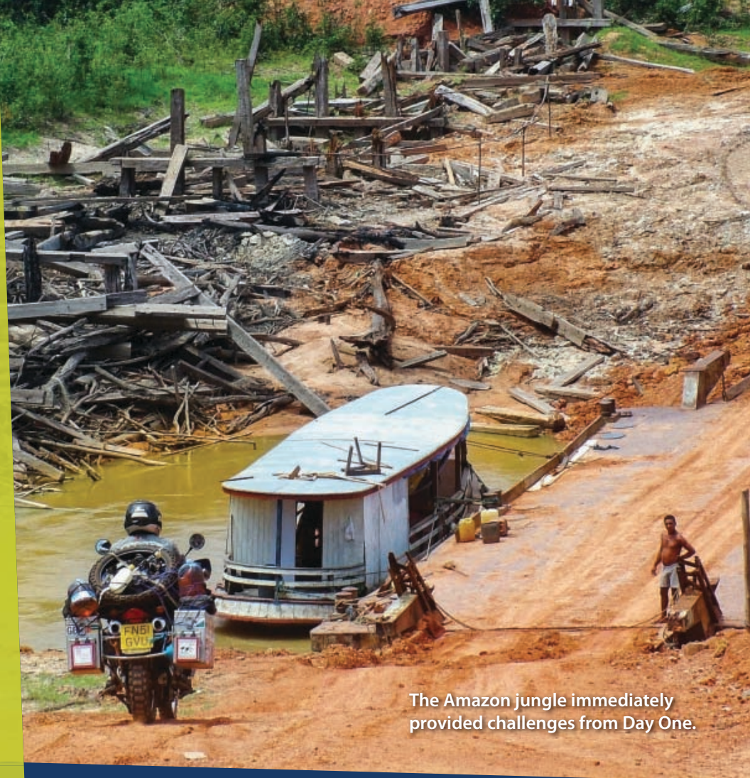
The Amazon jungle immediately provided challenges from Day One.

images of the warm yurts, the foaming milk tea, the soft autumn light and its kind, hospitable, and generous people.